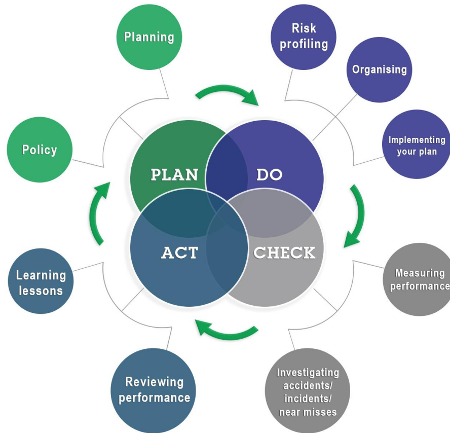
Fig. 2, PDCA Cycle